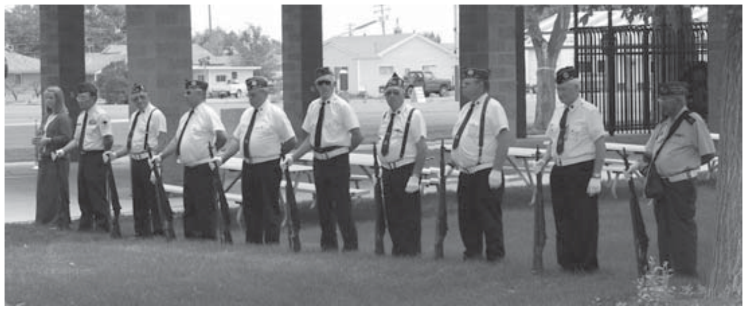
Men who served in the 442nd and from Delta's American Legion Post officiated at the 2003 Topaz Pilgrimage. The theme for that day was to honor soldiers as well as remember Topaz.