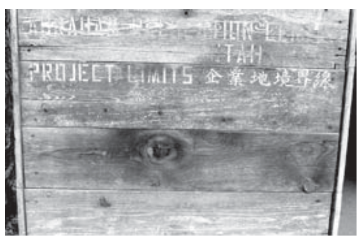
Two signs like this one were found at the Antelope RV park in Delta. They were used in the horseshoe pit.