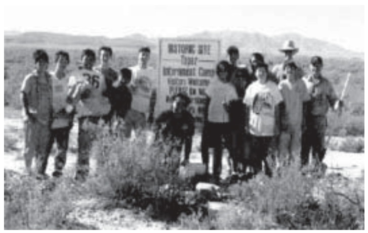
Scouts from Northern Utah volunteers to help preserve the Topaz site for an Eagle Scout project. The signs urge visitors to respect the historic property.

Look for both students and professors to come to the Pilgrimage on June 11.